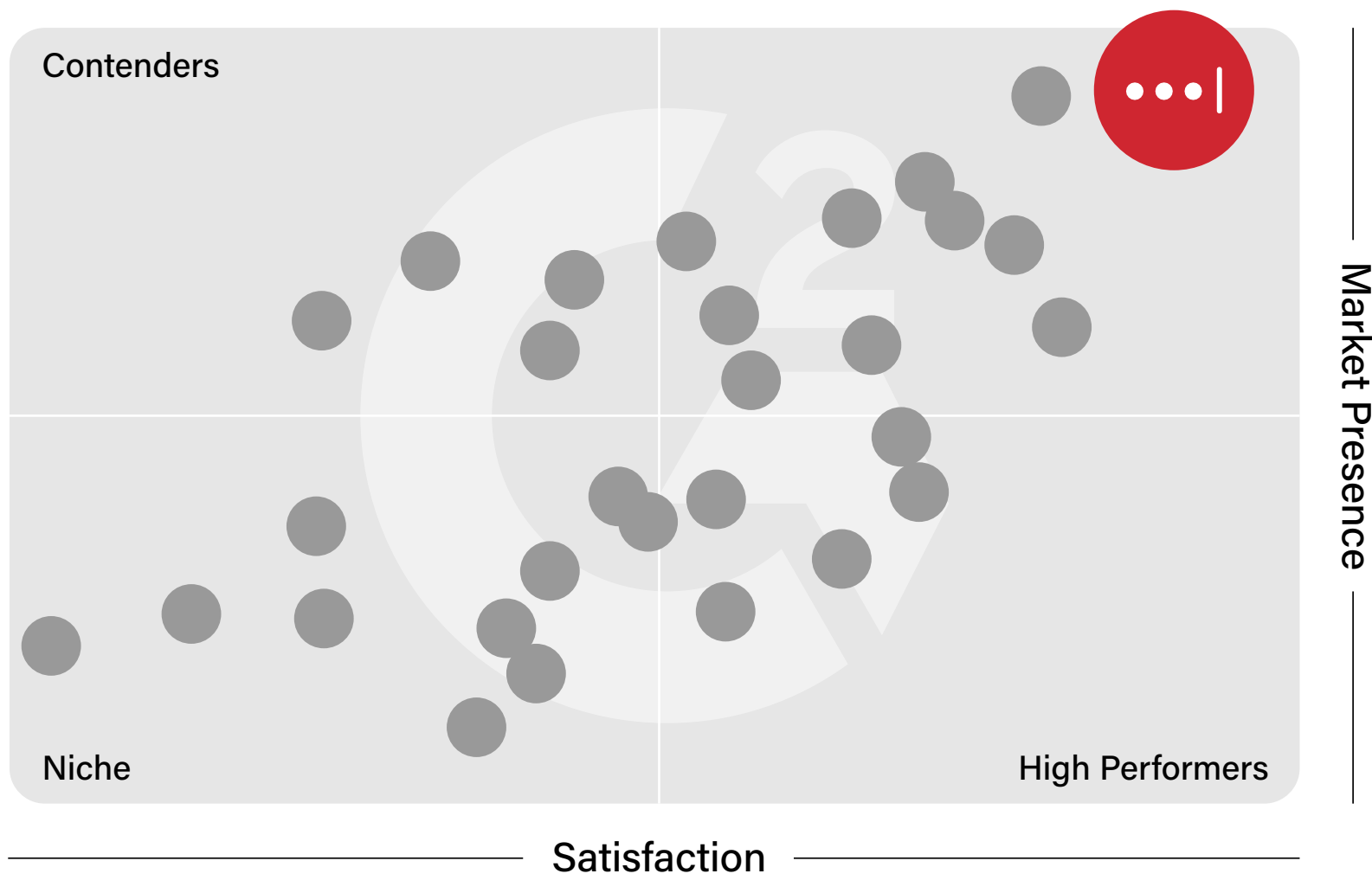
Grid® Report for Password Manager | Summer 2023 is based off of scores calculated using the G2 Grid® algorithms from reviews collected by May 23, 2023.